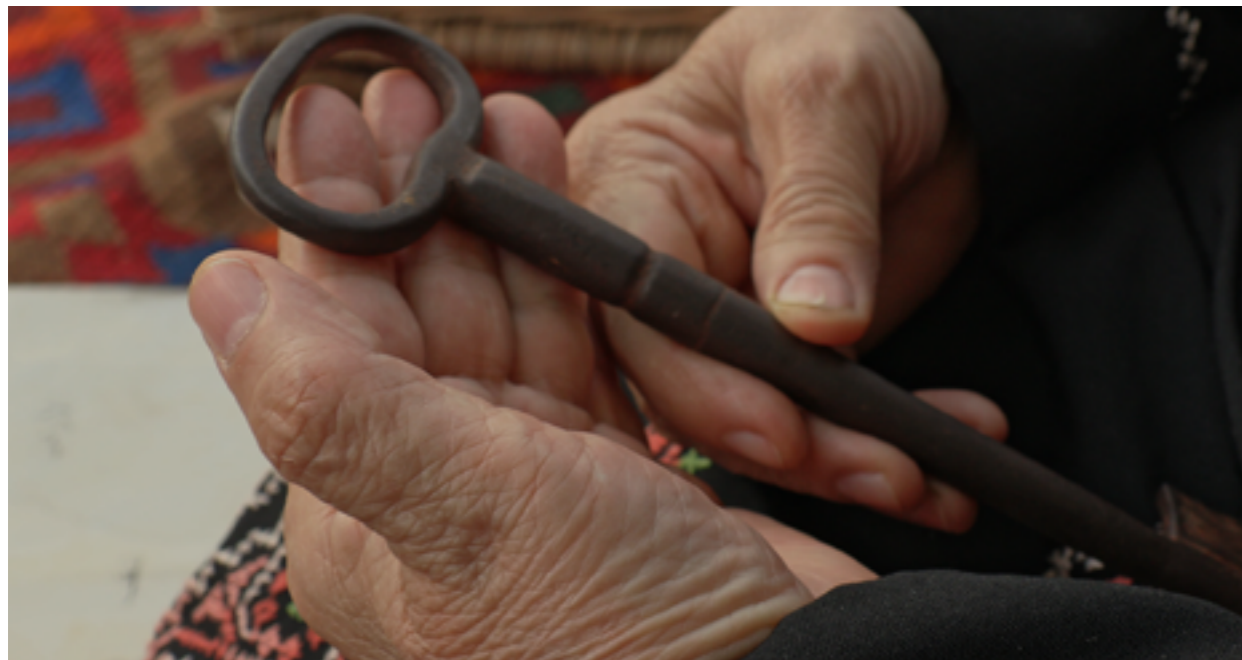
Under the Lemon Tree