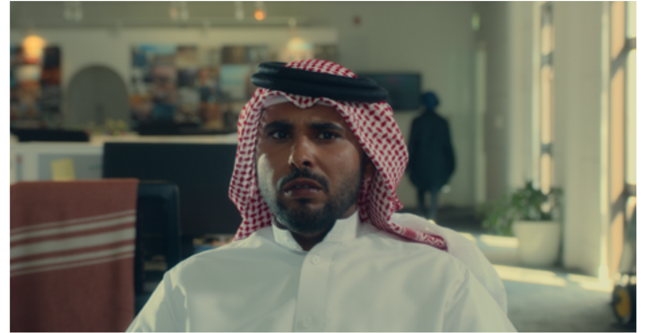
I Am Not My Father