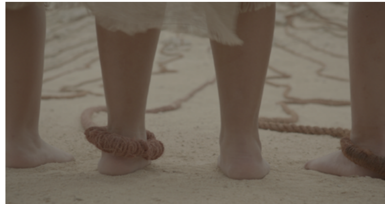
Our Time Is Running Out

Doha Film Institute Supported Film The journey of a disabled, but very determined little sea turtle named Aqua as he overcomes every obstacle from nest to sea. Director: Abdulla Mohammed Al-Janahi Qatar, Indonesia / No Dialogue / 2020 / 9 mins