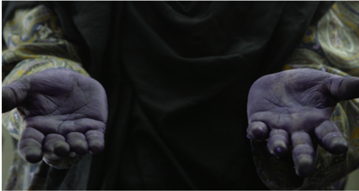
Treasures of the Past